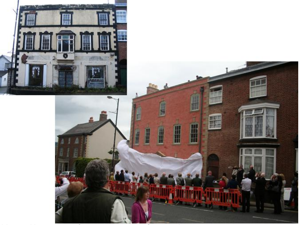
Mostyn House, Vale Street, Denbigh, a Grade II fine town house – historical research and uncovering of features during works returned the character of the building back to its Georgian origins

Communal Value - the value a historic asset has for the people who relate to it.