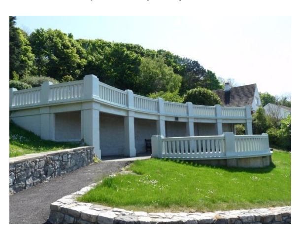
Hillside Shelter, Prestatyn – a Grade II listed 20<sup>th</sup> century structure, listed as an unusual and innovative concrete garden structure, the centrepiece of a public garden