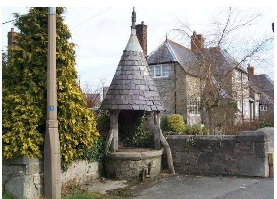
Terfyn Wellhead, Bodelwyddan – a Grade II listed picturesque well of around 1868

Communal Value - the value a historic asset has for the people who relate to it.