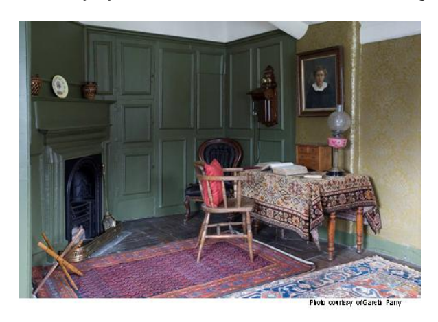
Nantclywd y Dre, Ruthin - interior panelling, historic fireplaces and flooring