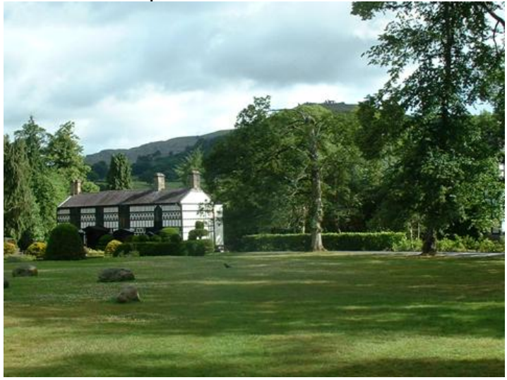
Plas Newydd, Llangollen – A Grade II* listed building in a Grade II* historic parkland setting

7.2.2 The setting of a listed building must be taken into account even when a planning application is not on the land where the listed building is located. In these circumstances it is important to: -