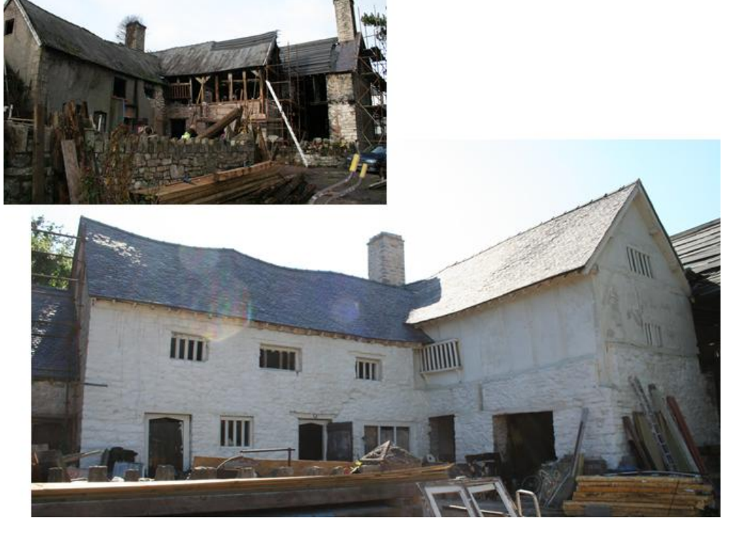
Bryn-y-Parc, Park Street, Denbigh – a Grade II* listed building, where the justification to restore the building to its original character of the late 16<sup>th</sup> / early 17<sup>th</sup> century was accepted after careful and detailed research