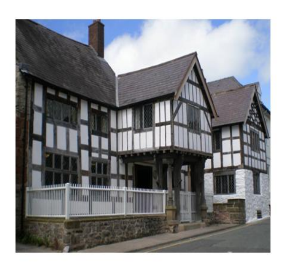
Nantclwyd y Dre, Ruthin – a Grade I listed building which has several phases of construction

to the building, including any curtilage structures, that have been in place prior to 1 July 1948. This is irrespective of the reason for listing. You should also note that the list description has no statutory force - that is, there will be items, fixtures or fittings in the listed building even though it is not described on the listing document.