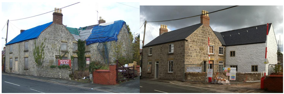
Before and after - 37-39 Pendyffryn Road, Rhyl